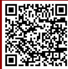
Winners Campus Fellowship