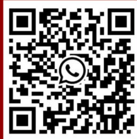
Winners Chapel Coventry WhatsApp Group