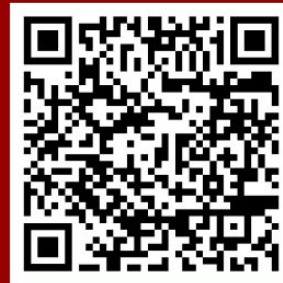
Winners Campus Fellowship