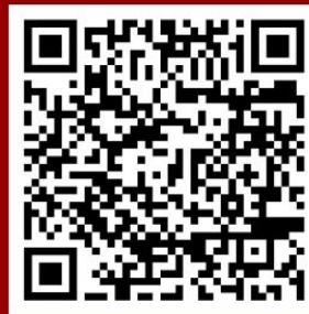
Winners Campus Fellowship