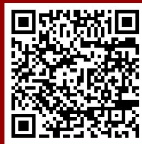
Winners Campus Fellowship