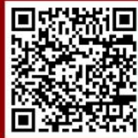
Winners Campus Fellowship