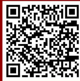
Winners Campus Fellowship